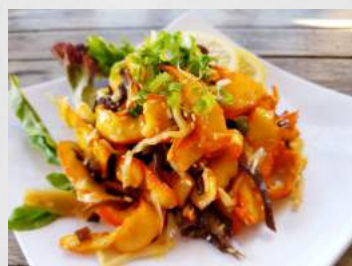
Spicy Squid Salad 5.95 thinly sliced squid marinated in special chili sauce