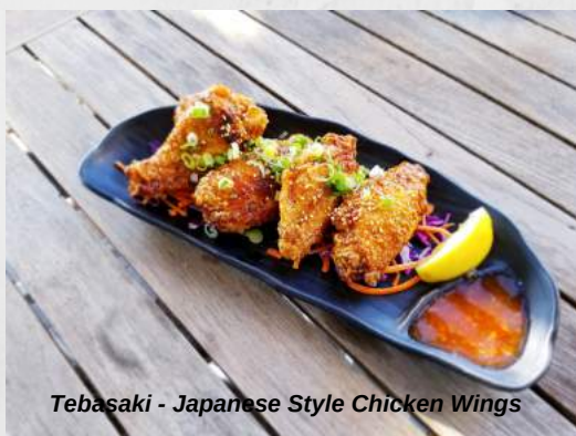
Tebasaki - Japanese Style Chicken Wings