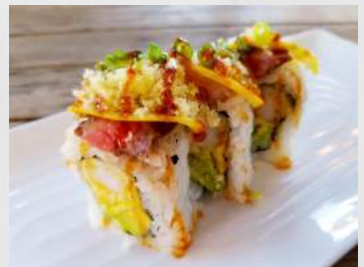
Texas Roll In: Shrimp Tempura & Avocado Out: NY Steak & Lemon