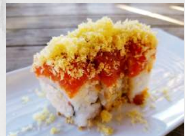
Spicy Volcano Roll In: Crab Out: Spicy Tuna & Crunch