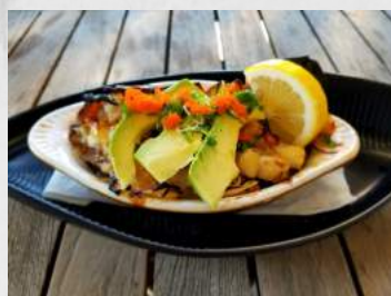
Lobster Dynamite 10.95 Mushroom, onions, scallop and Maine Lobster topped with avocado baked