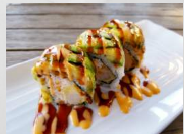
Yellow Dragon Roll In: Shrimp Tempura & Crab Out: Avocado