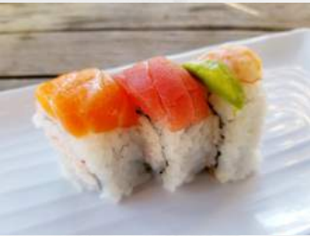
Rainbow Roll In: Crab Out: Assorted Fish