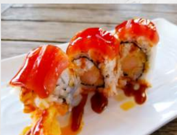
Sumo Roll In: Shrimp Tempura Out: Tuna