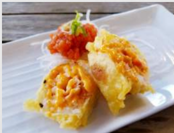
Valencia Roll (2 pc) In: Spicy Shrimp Out: Soy Paper (Fried) & Spicy Tuna on top