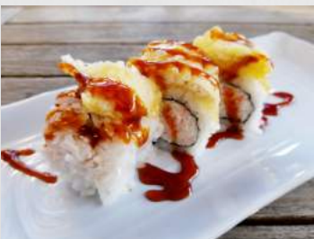
Tony Special Roll In: Crab Out: White Fish Tempura