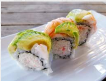
Shrimp Avocado Roll In: Crab Out: Avocado & Shrimp