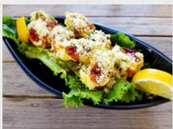
Jalapeno Pop (2 pc) 5.95 Stuffed Jalapeno with spicy tuna and cream cheese - deep fried