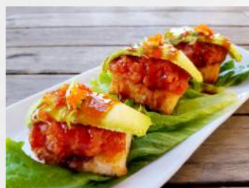
Crispy Rice (3 pc) 5.95 Crispy Rice topped with spicy tuna and avocado; eel sauce & chili oil