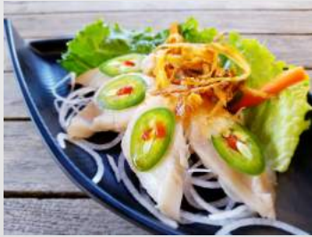
Yellowtail Jalapeno (4 pc) 6.95 4 pcs of fresh Yellowtail garnished with Jalapeno slices and fried onion