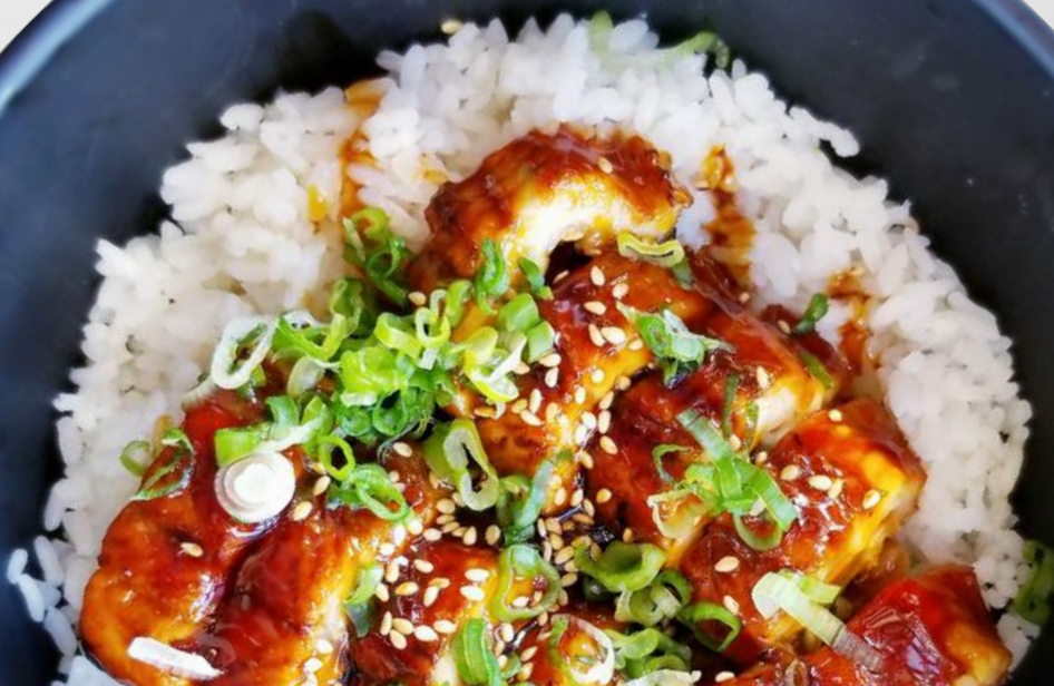
BBQ EEL DON (UNA-DON)