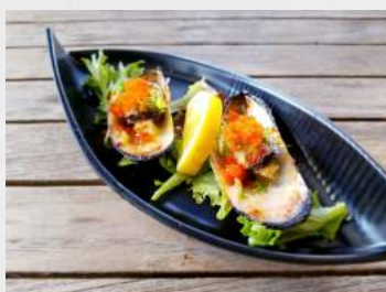
Baked Mussel (2 pc) 3.95 Broiled mussel in dynamite sauce; garnished with masago and green onion