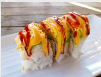
Super Dragon Roll In: Crab Out: Avocado / Spicy Shrimp & Crab