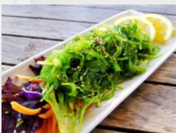
Seaweed Salad 5.25 seaweed seasoned with sesame oil and bit of vinegar