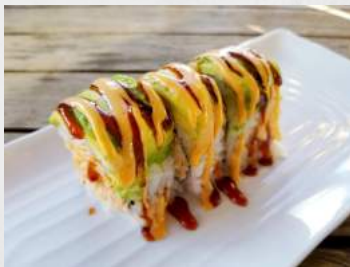
Scary Roll In: Spicy Shrimp & Crab Out: Avocado