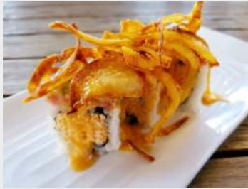
Lady In Red Roll In: Spicy Shrimp Out: Seared Tuna, Avocado & Fried Onion