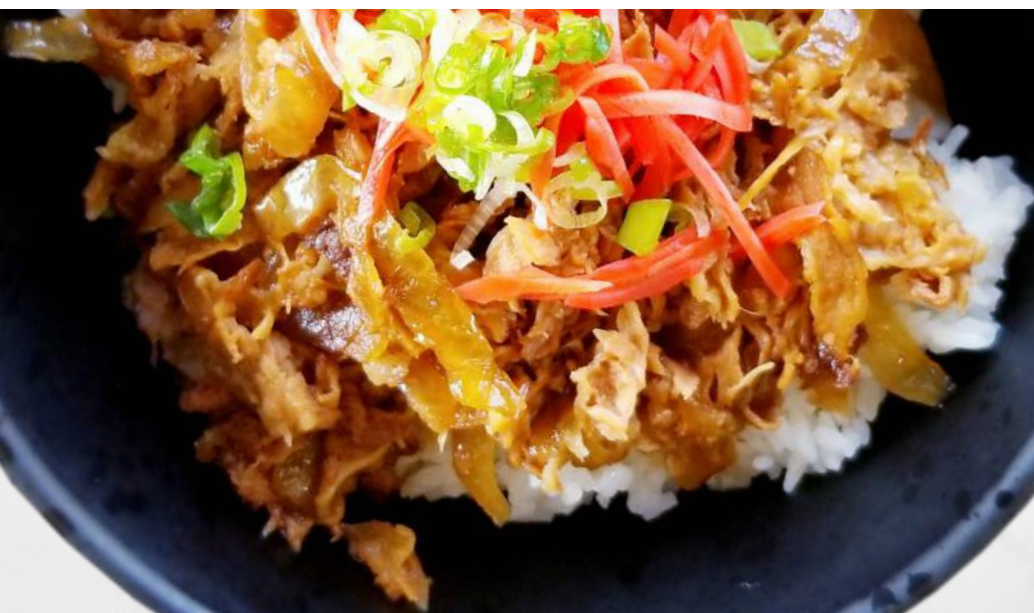
BEEF BOWL (GYU-DON)