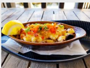
Dynamite 8.95 Mushroom and scallop baked with dynamite sauce