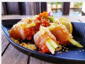
Albacore Delight (4 pc) 6.95 Spicy Tuna & Cucumber wrapped with fresh Albacore