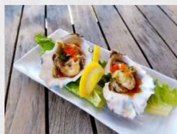
Halfshell Oysters (2 pc) 4.95 Fresh oysters with ponzu sauce; topped with masago and green onion