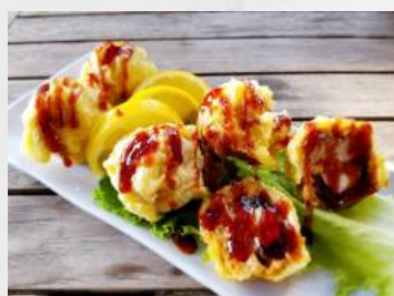
Dragon Ball (5 pc) 4.95 Stuffed mushroom with salmon and cream cheese - deep fried