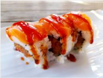
Kura Roll In: Spicy Tuna Out: Salmon