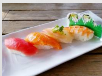
Appetizer Sushi 8.95 Tuna, Salmon, Shrimp, White Fish & Yellowtail Sushi (1pc each) / 4pc CA Roll