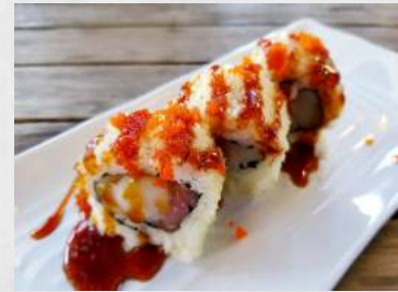
Scallop Crunch Roll In: Spicy Scallop & Spicy Tuna Out: Masago & Crunch