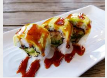
Ninja Roll In: Eel Tempura & Jalapeno Out: Avocado