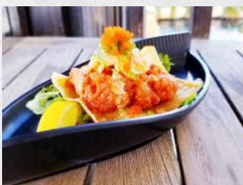
Japanese Pizza (1 pc) 3.95 Spicy tuna, spicy shrimp and avocado on crispy wonton skin