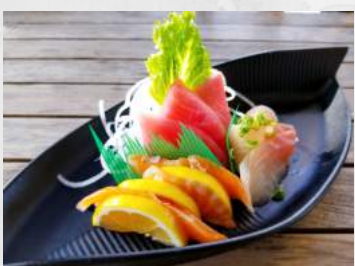
Appetizer Sashimi 10.95 3 Tuna, Salmon, White Fish & Shrimp - 3 pcs each