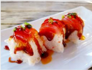
Red Dragon Roll In: Crab (No Ric) Out: Tuna